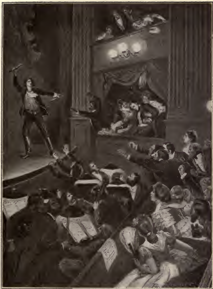
Assassination of Lincoln